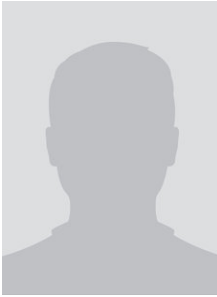
KEITH GENTRY *Not pictured